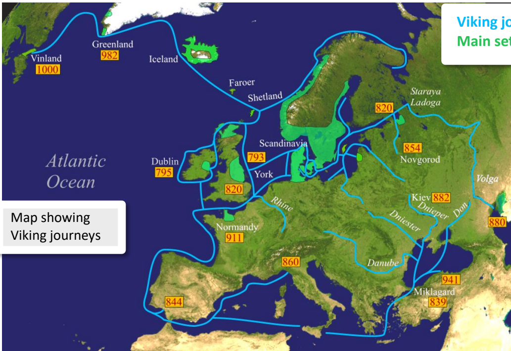
Map showing Viking journeys