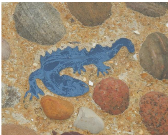
Close-up of the blue glass newt in the bottom of the pool.