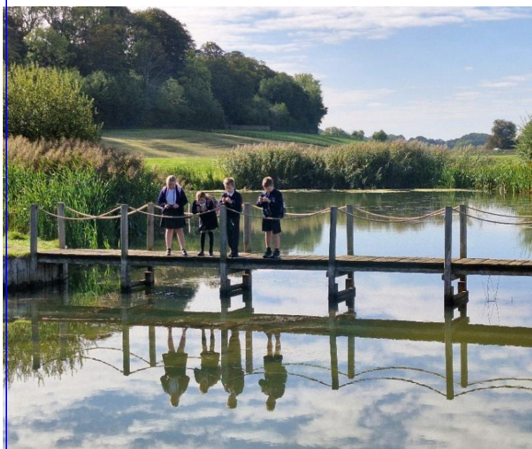
Reflections of a lovely day out